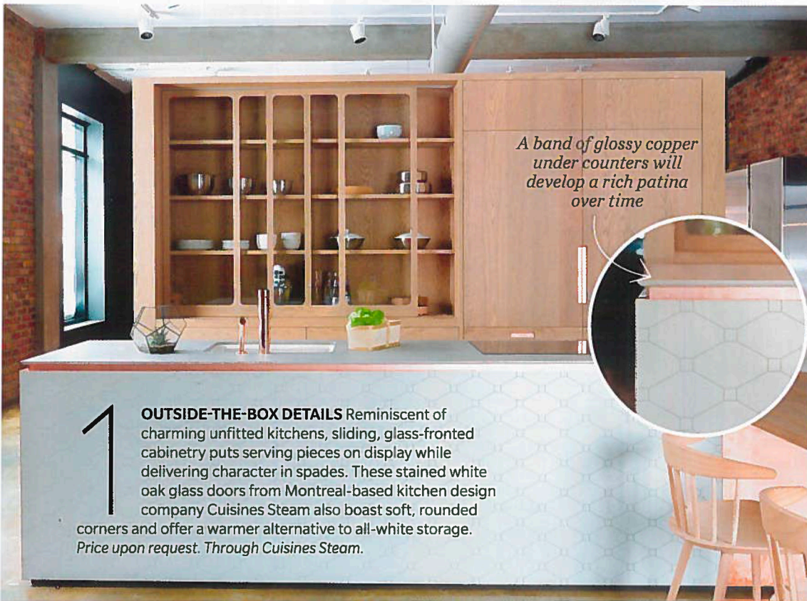
A band of glossy copper under counters will develop a rich patina over time

1 OUTSIDE-THE-BOX DETAILS Reminiscent of charming unfitted kitchens, sliding, glass-fronted cabinetry puts serving pieces on display while delivering character in spades. These stained white oak glass doors from Montreal-based kitchen design company Cuisines Steam also boast soft, rounded corners and offer a warmer alternative to all-white storage. Price upon request. Through Cuisines Steam.